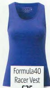
Formula40 Racer Vest £35

While she's dancing up a storm, Strictly Come Dancing's Flavia Cacace stays healthy by wearing a specially-developed kit by HPE clothing. It reduces sweating, kills bacteria and prevents injury by supporting your muscles. Visit Hpe-shop.com . Prices start at £35.