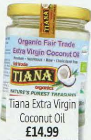
Tiana Extra Virgin Coconut Oil £14.99

Healthy living guru Gwyneth Paltrow swears by coconut oil. She says: "While I'm in the bath, I use an exfoliating mitt that stimulates the skin and leaves it soft and bump-free. Afterwards, I slather my body with extra virgin organic coconut oil." Get your Tiana Extra Virgin Coconut Oil, £14.99 , from Ocado.